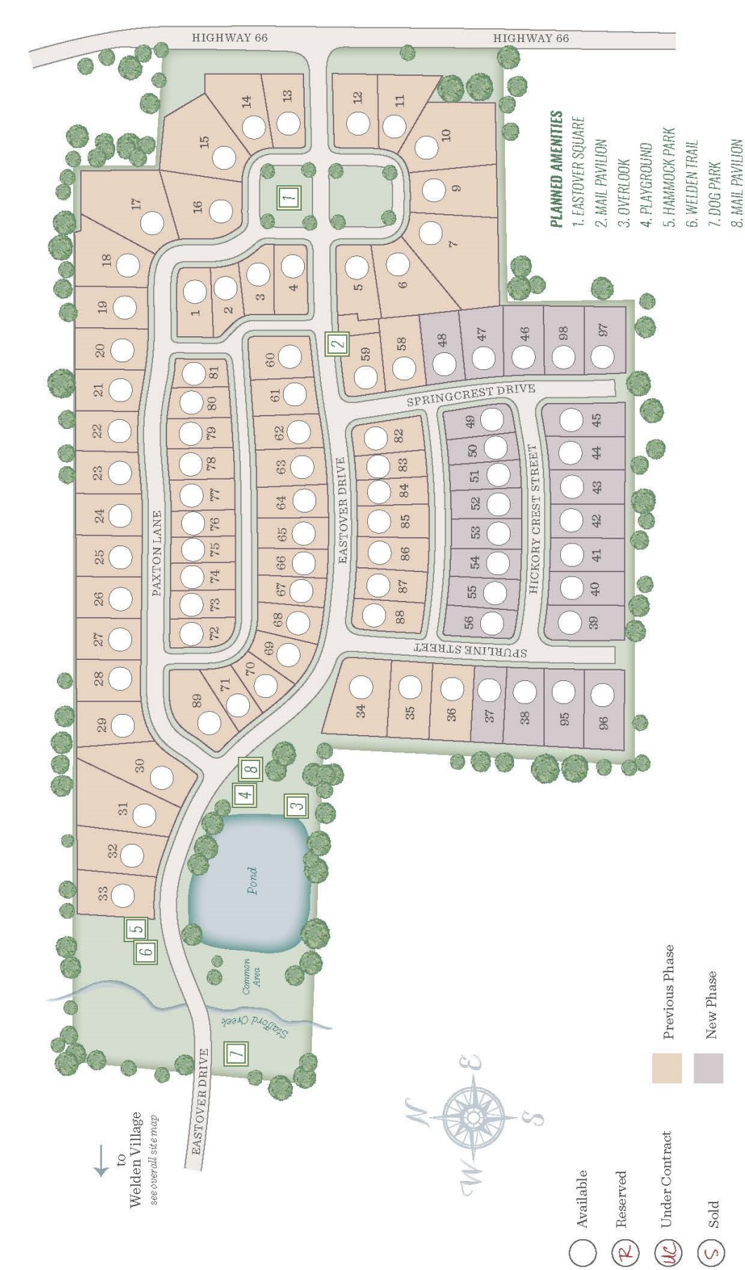
Map is for illustrative purposes only. Actual site conditions may vary and lot sizes, dimensions and layout are subject to change without notice. 9.17.18